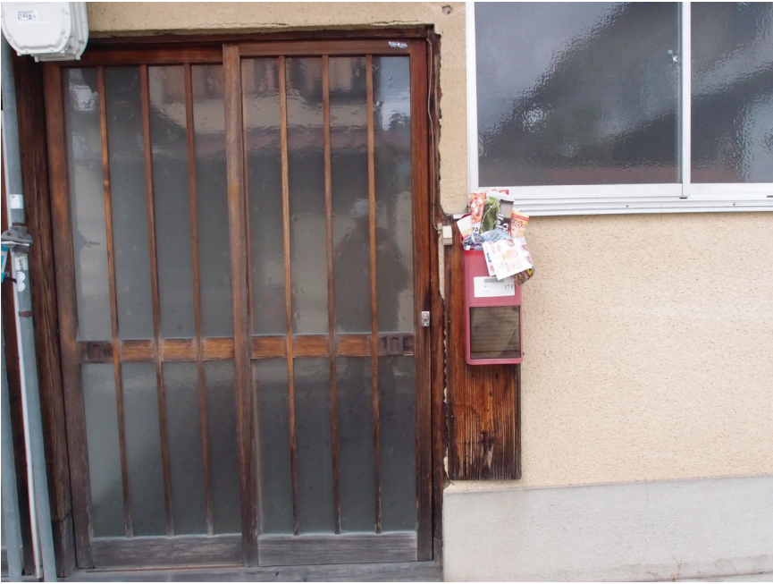
Figure 4. Akiya house, with leaflets overflowing the unused mailbox.

that distinguished the aesthetic presence of these akiya , sometimes only apparent after time had passed. In some cases, the individuals to whom we delivered food were like islands left by the rising sea of akiya all around them.