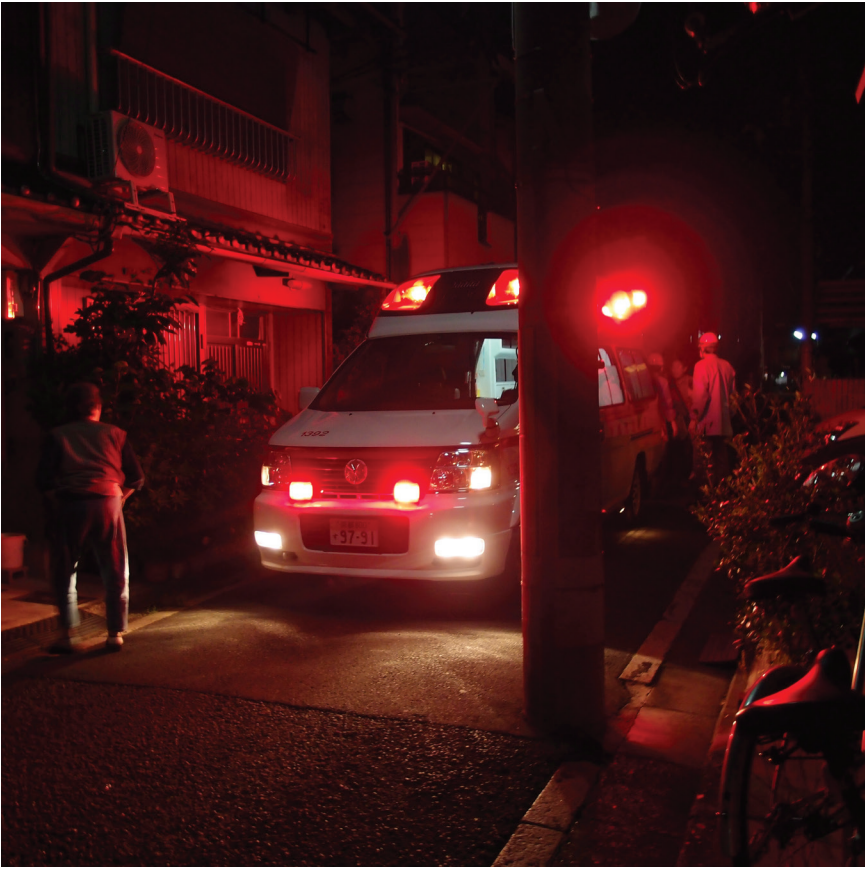
Figure 1. The street splashed in the red lights of the ambulance, as curious neighbors gather expectantly.

Zigon 2014). When I refer to dwelling, then, it is in the practical material and embodied sense of being-at-home-in-the-world with others (Jackson 1995). Older people in Japan often embody this sense of dwelling, as a link between geographically based generations, living and dead, or through long-cultivated links to community life, local political activity, and leisure with friends and neighbors (Danely 2014). The regular appearance of the shadowy specter of kodokushi , however, throws the inevitability of such dwelling into uncertainty. Anxiety about kodokushi reflects concerns that the locus of dwelling and even old age itself as a terrain has become uninhabitable, despite extensive local and national investment in long-term care infrastructure (Tamiya et al. 2011; Danely 2016).