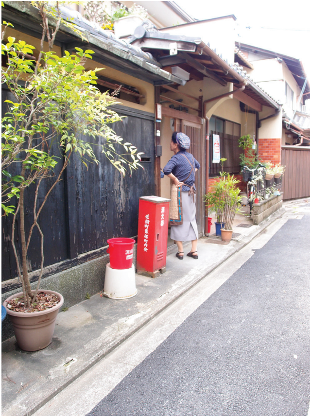
Figure 2. A visit from the minseijin rarely crosses the threshold of the home of the solo-dwelling older person.

course, as the case of Okura-san indicates, even when it looks as though someone might be very vulnerable, there is little that ordinary community members or even minseijin feel they ought to do.